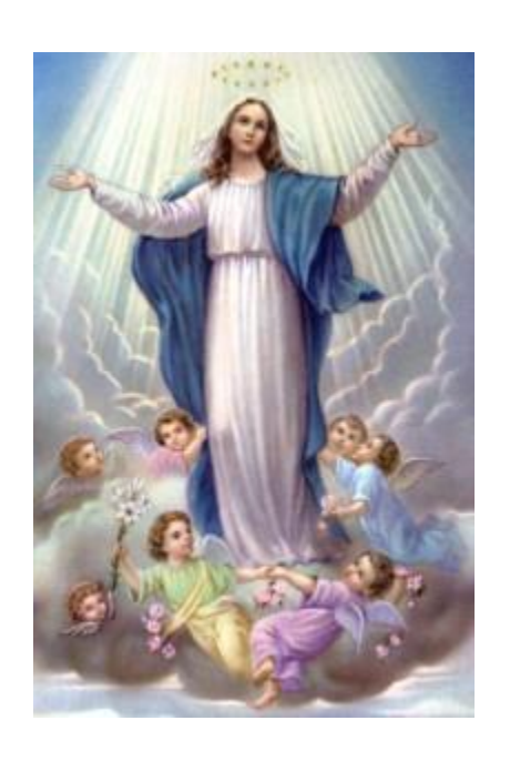
Day Thirteen The Queen of Heaven in the Kingdom of the Divine Will departs for the Temple and gives example of total Triumph in the Sacrifice.