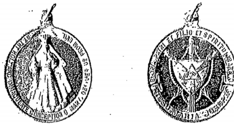
The medal of Our Lady of America, including the picture of our Lady on one side and Coat of Arms of Christian Family on the other.

May your valiant Spouse, St. Joseph, with the holy Angels and Saints, assist you and us in "renewing the face of the earth." Then when our work is over, come, Holy Immaculate Mother, and as our Victorious Queen, lead us to the eternal kingdom, where your Son reigns forever as King. Amen. (200 days)