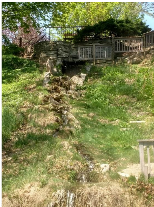
The Springs today