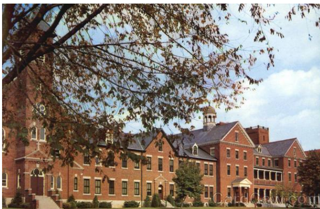
Historical photo of the Kneipp Springs Sanitarium - convent of the Sisters of the Precious Blood