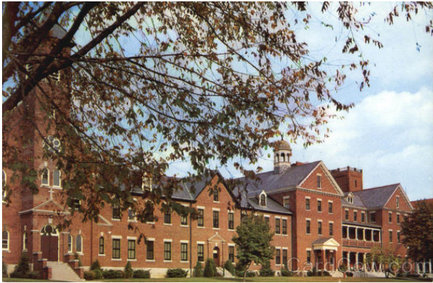
Historical photo of the Kneipp Springs Sanitarium - convent of the Sisters of the Precious Blood